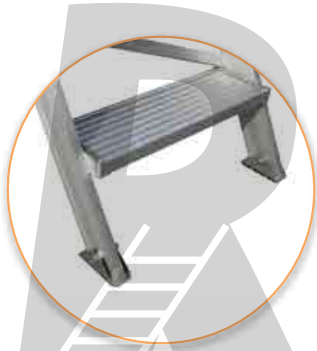
b) Base Plate