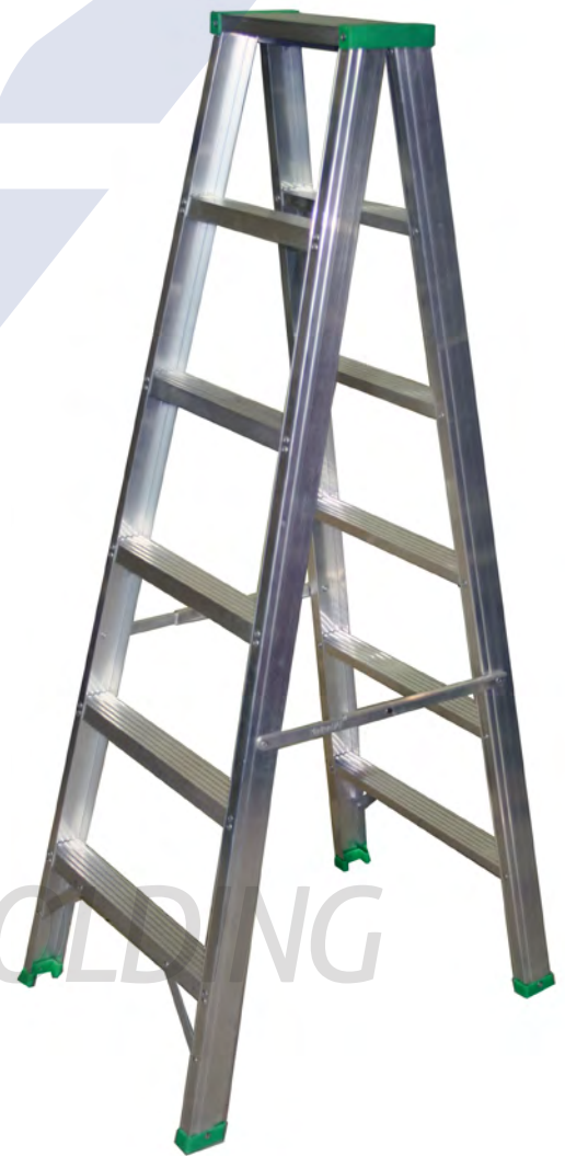
DOUBLE SIDED LADDER LOAD CAPACITY: 125 KG